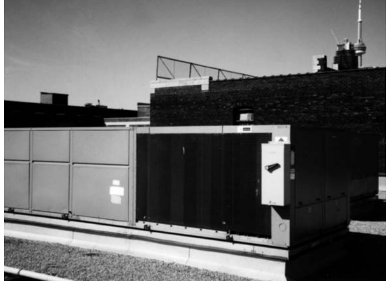
This standard commercial rooftop unit required special noise control treatment including strategic rooftop placement.

Acoustical and mechanical consultants specified a Vibro-Acoustics rooftop noise control package with rooftop curbs, unit support channels, noise control insulation panels, spring isolators with a deflection of 3 inches, elbow silencers with HTL casings and flex connections. This package, with the addition of Vibro-Acoustic silencers placed downstream at the studios, was designed to control the noise and vibration from the rooftop units. Foley Studios achieved NC-11 in a facility which is now recognized as one of the best of its kind.