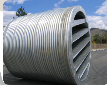
Above System solution for underground ventilation system Left Completed section of culvert pipe CD silencer

The system solution helped the design and construction teams to not only meet all system requirements, but also avoid lawsuits by disgruntled local residents.